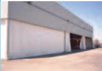
Soper's retractable curtains can be large or small. This outdoor application protects the loading dock from the elements.