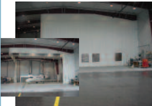
Soper's retractable curtains can be used in an aircraft hangar

From heavy industry to the automotive aftermarket – from aircraft hangars to recreational facilities - there is always a need to temporarily enclose or section off a certain area.